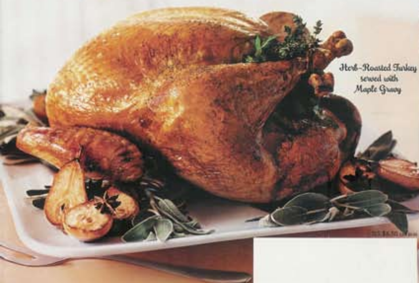
Herb-Roasted Turkey served with Maple Gravy

best recipes strategies shortcuts tips table settings wines